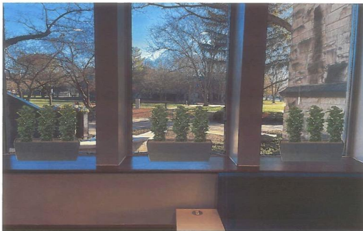
Windows of Union entry