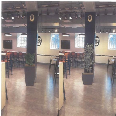
Lower level; between south entry and Starbucks. Cover 4 of the 6 pillars. Two of each that are pictured