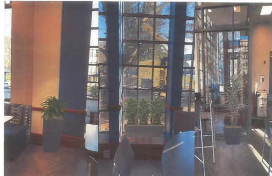
Starbucks seating: 4 containers all together [ 2 rectangles in windows]